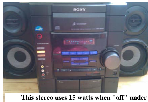
This stereo uses 15 watts when "off" under a certain display setting.

Next, see what you would save by cutting your phantom loads. For each appliance that has a wattage draw even when turned off, enter a “0” in the potential “Watts-off” column. To actually achieve these cost savings, plug each of these devices into a switchable outlet strip and switch it off when you’re not using the device or consider the use of a “smart strip” that automatically cuts phantom loads when the device isn’t in use.