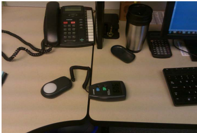
The light at this workstation is measured where reading commonly takes place.