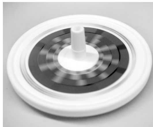
Flicker checking showing the checkered pattern typical of magnetic ballasts