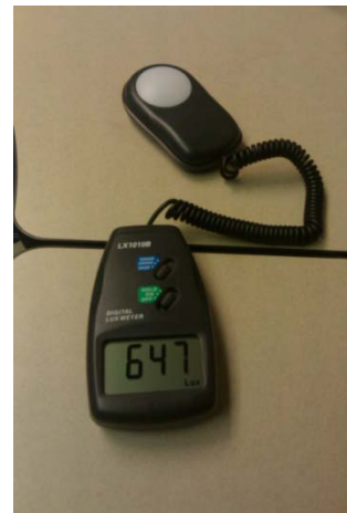
This meter displays the light level in lux on the digital screen.

The meter reading can then be compared to the suggested levels above to see if a space has more or less light than needed. If more light is being provided than suggested levels above, consider “delamping”, or removing lamps from the space until the suggested light level is reached.